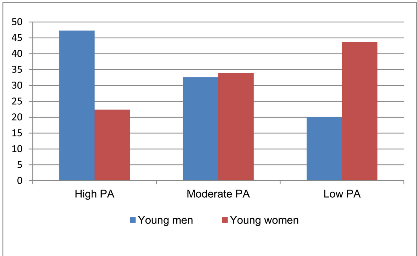
Fig. 3. Comparison of PA in young men and young women

The most preferred sports by 12th grade students are fitness, running and soccer – sports with heavy physical exercise and cardio-training that stimulate bone's health [26, 27].