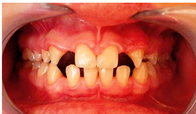
Fig. 3, 4 and 5. Completed orthodontic treatment

After the obtainment of the desired result, a stabilization period, during which a retention plate – space-keeper has to be worn, was provided ( fig. 6 ).