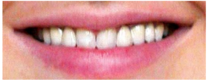
Fig. 9. Completed orthodontic-prosthetic treatment

The adhering to all contiguous stages of treatment as well as the synchronization of both clinicians and patient's participation in the treatment process was essential for avoiding of a relapse.