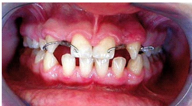
Fig. 6. The retention plate

After the obtainment of the desired result, a stabilization period, during which a retention plate – space-keeper has to be worn, was provided ( fig. 6 ).