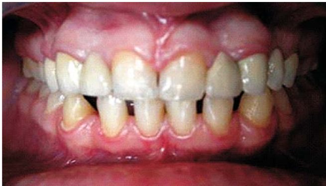
Fig. 8. Final restorative constructions

The grinding was carefully performed in a way taking off a minimal amount of hard tooth tissues, so the teeth vitality could be preserved. The treatment was completed with porcelain-fused-to-metal restorative constructions (fig. 8 and 9).