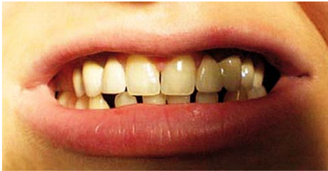
Fig. 7. Temporary prosthetic constructions

The grinding was carefully performed in a way taking off a minimal amount of hard tooth tissues, so the teeth vitality could be preserved. The treatment was completed with porcelain-fused-to-metal restorative constructions (fig. 8 and 9).