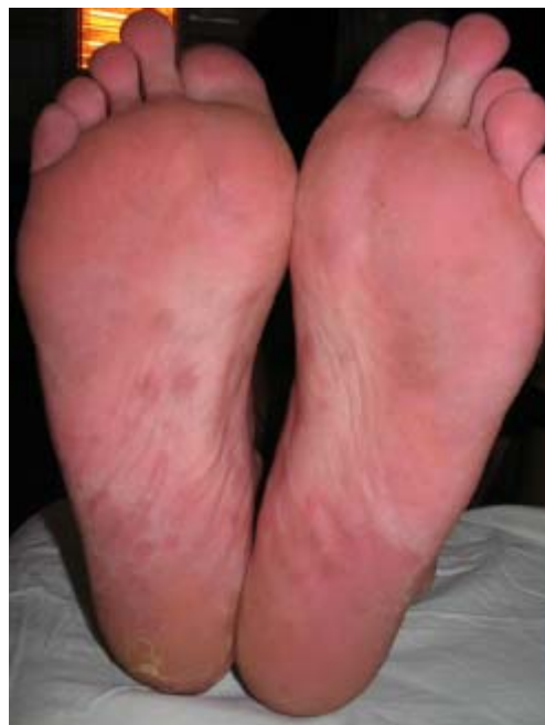
Fig. 4 (a, b): Complete clinical resolution of the skin lesions.