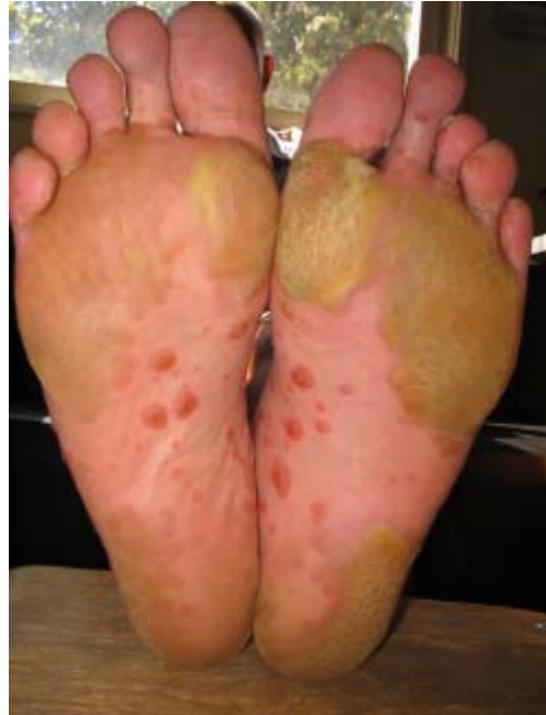
Fig. 1 (a, b, c, d): Keratoderma blenorrhagicum skin lesions a week after their appearance.