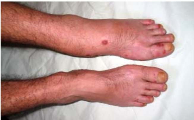
Fig. 2: Articular involvement – swelling of the left ankle.