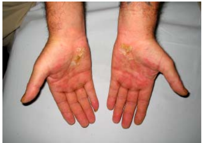
Fig. 3 (a, b): Initial clinical resolution of the skin lesions.