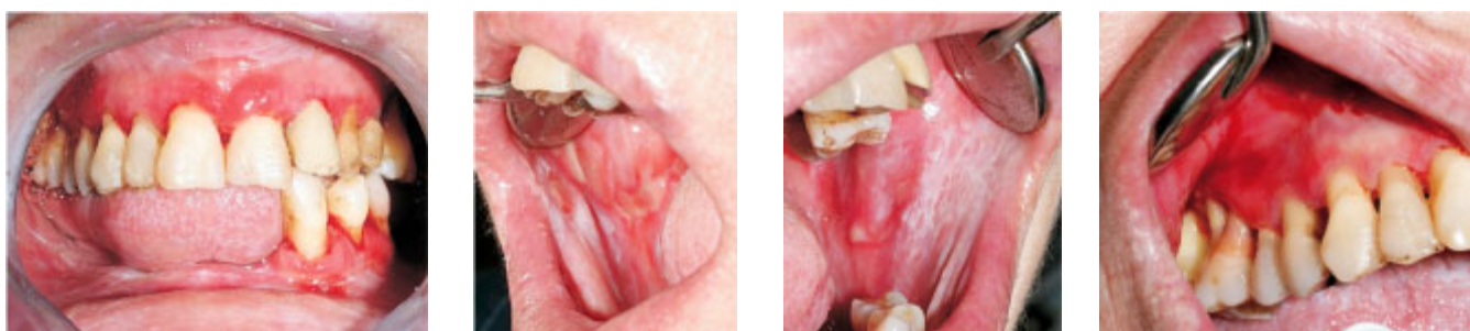
Fig. 18, 19, 20, 21, 22 – Oral lesions in woman with erosive lichen planus.