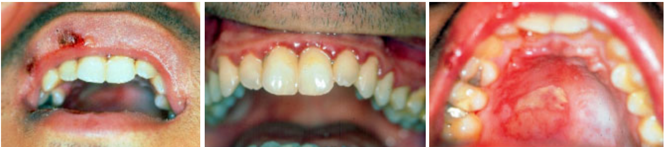
Fig. 8,9,10 – Erythema multiforme in 24 years old man after systemic administration of nonsteroid anti-inflammatory drug.