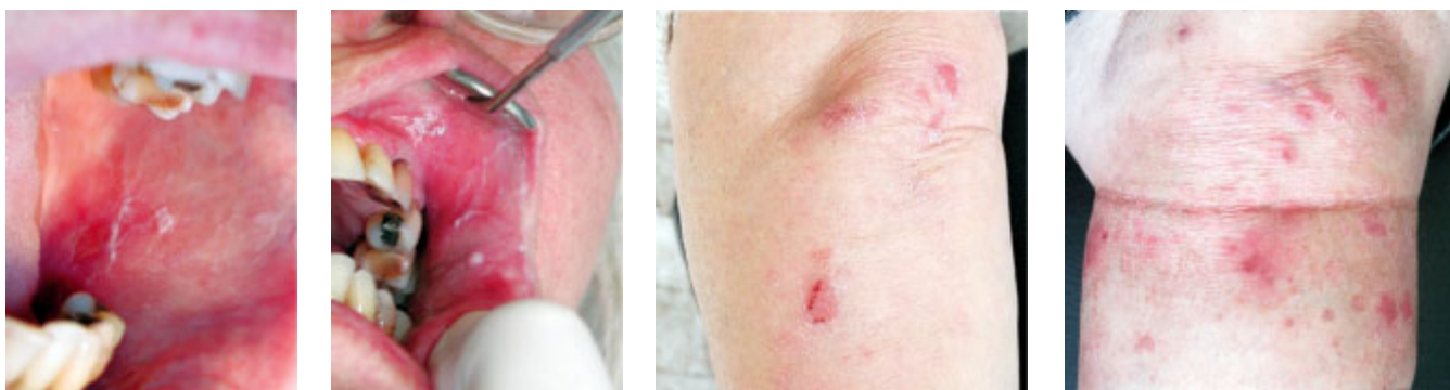
Fig. 11, 12, 13, 14, 15, 16, 17 – Oral and cutaneous manifestations of psoriasis vulgaris in 68 years old woman.