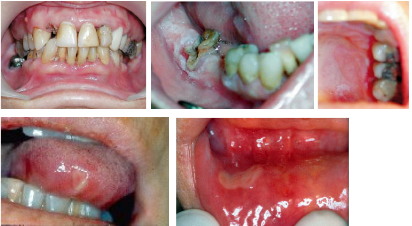
Fig. 3, 4, 5, 6, 7 – Oral lesions of pemphigus vulgaris in 56 years old woman.