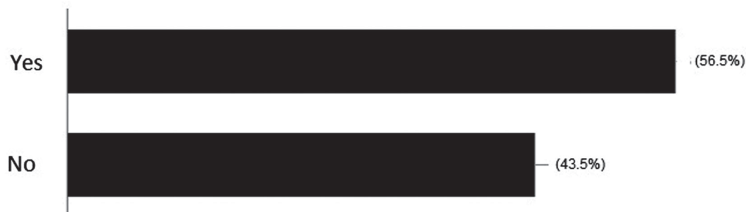
Fig. 3. To what extent you felt sure in your first laparoscopic surgery?